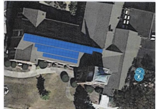
This aerial photo shows which portion of the church's roof could host solar panels.