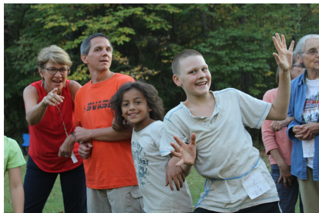
CMCers of all ages enjoy the church-wide game at the 2017 retreat.

To register for retreat, go to cmcva.org or visit the table in the Fellowship Hall on Sunday, Sept. 15.